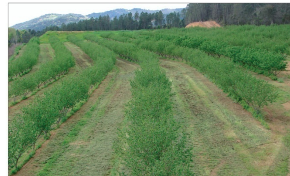
Hazelnut young orchard in Girona (North-East Spain).