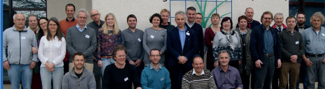
Meeting 2017/Balandran (France)