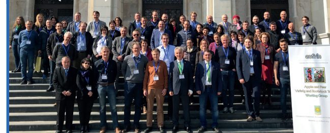
Meeting 2019 Bukarest (Romania)

NIAB EMR - East Malling Research*| KENT www.emr.ac.uk