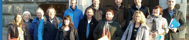
Meeting 2015/Vilnius (Lithuania)

LSIFG - Latvian State Institute of Fruit-Growing*| DOBELE www.dds.lv