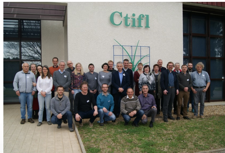
EUFRIN (closed session) March 3 rd 2017