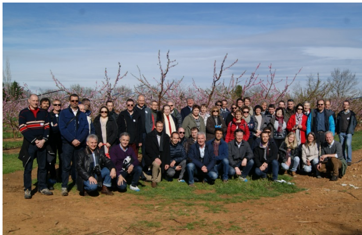
EUFRIN-meeting Balandran 2017